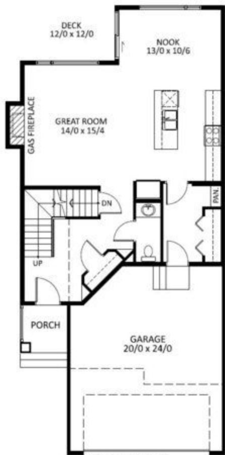
MAIN FLOOR PLAN 838 SQ.FT.